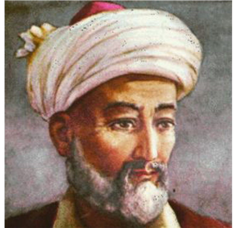
FAKHR AL DIN AL RAZI